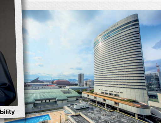
Kobe Portopia Hotel