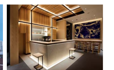
Agora Tokyo Ginza