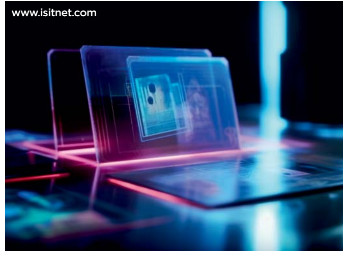
Data breaches cost millions; choose proactive cybersecurity

"That is why we are now looking to anchor the company's activities in