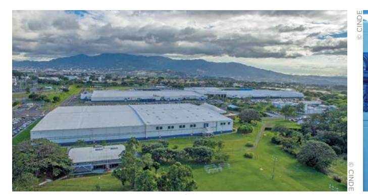
Intel has recently invested nearly $1 billion in Costa Rica

I believe Costa Rica's economy is very resilient and it has shown that resilience. We have a vibrant tourism industry that is recovering from the pandemic and bringing in foreign exchange, plus we're increasing