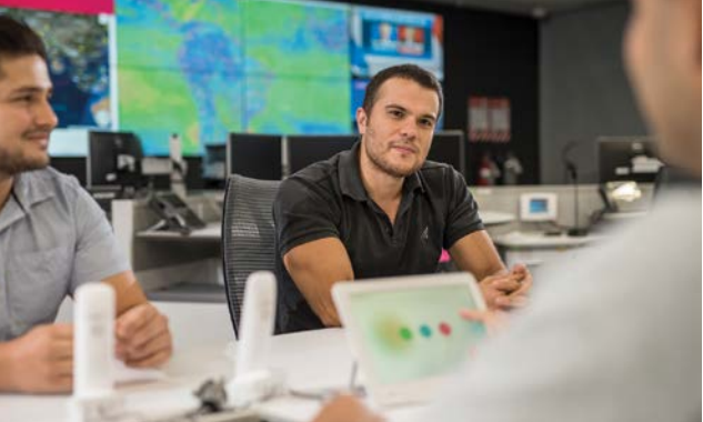
UCR receives $540 million a year in state funding

Another common strand running through all programs is sustainability, he reveals: "UCR has been at the vanguard in incorporating adaptation to and mitigation of the climate crisis in its work and is supporting other institutions and the private sector to strengthen their efforts toward sustainability."