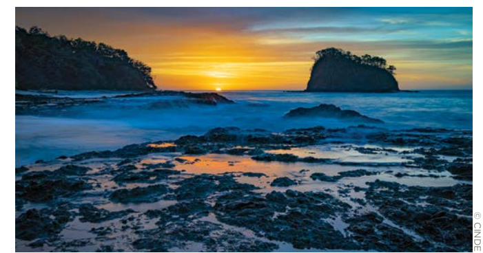
Bahia de los Piratas, one of around 300 beaches in Costa Rica