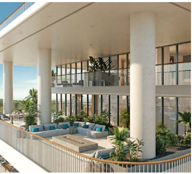
Infinity will bring its residents a lifestyle beyond dreams