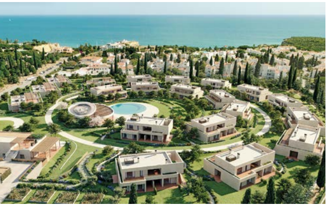
White Shell is a secret world of eco-friendly luxury