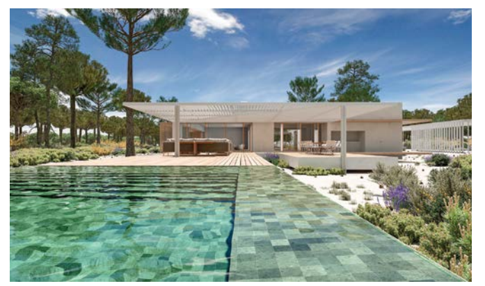
Muda Reserve offers the embrace of nature

Those seeking complete emersion in nature should look no further than Muda Reserve, a mere 5 kilometers inland from Alentejo's beaches. In unspoilt rural splendor, Vanguard has designed an entirely new concept of private-estate living that revolves around a village, Aldeia da Muda, which has been inspired by traditional regional architecture but provides all the comforts and support services a small, modern community needs. Surrounding this hub are spacious, fully infrastructured and extremely private plots for 50 village farms on which you can build your 500-square-meter dream home, either with the help of Vanguard's portfolio of renowned architects or to your own specifications. Launched in 2019, these innovative farms are in significant demand with over half having been sold already. 80 percent of these have attracted international buyers, particularly from the U.S.