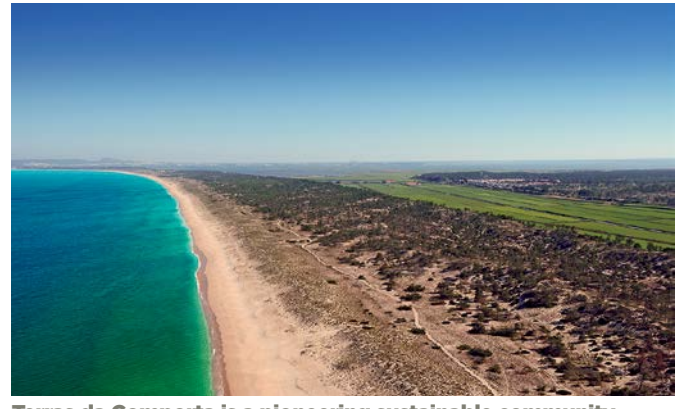
Terras da Comporta is a pioneering sustainable community

superbly designed tower project is set to transform the city's skyline and will be home to 195 spacious apartments ranging from studios to six-room duplexes. From its 26 floors, Infinity's residents will enjoy a vision of Lisbon that no one else has ever experienced, with breathtaking panoramic views over neighboring Monsanto National Park's 980 hectares of forest, as well as the city and its majestic river. Located within easy access of the city's best transport links, including its airport, the emblematic Infinity will offer a holistic concept of the ultimate in sophisticated luxury living.