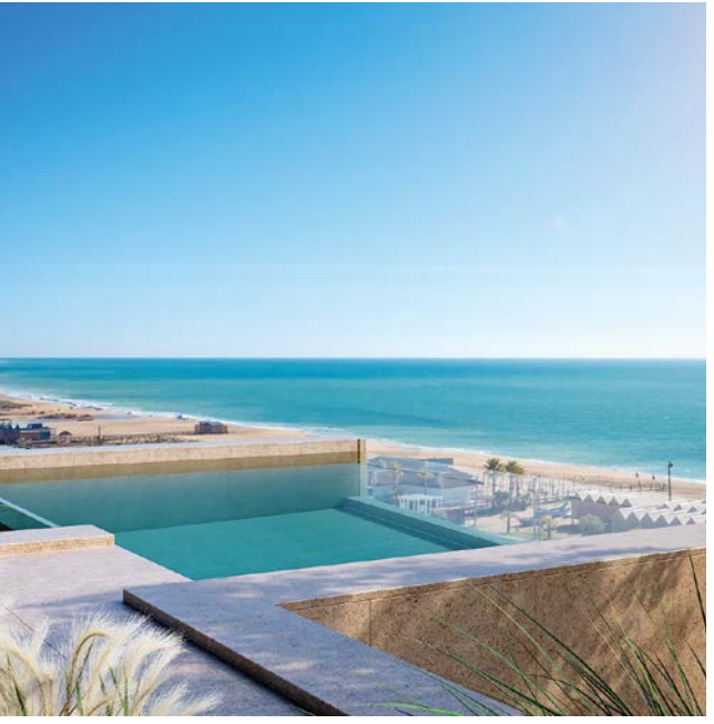
Bayline is your opportunity to experience beachfront living