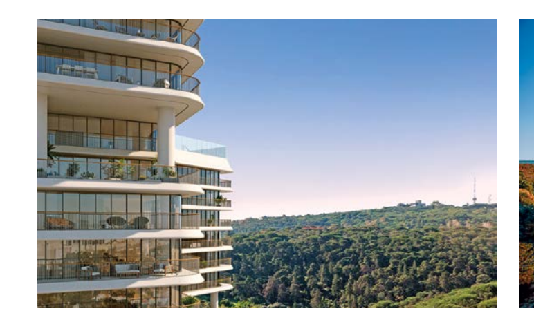
CONTENT FROM COUNTRY REPORTS

ning practices are being encouraged. What part do they play in Vanguard's developments?