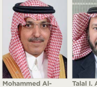
CONTENT FROM COUNTRY REPORTS

"We will continue to strengthen our leadership position through extending market reach, product portfolio enhancements and diver-