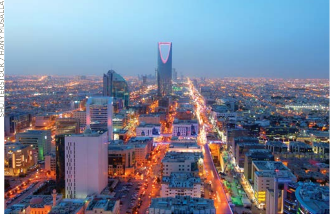
Saudi Arabia blends rich traditions with modern infrastructure

"Vision 2030 lays the essential groundwork for diversifying sources of income, enhancing investment conditions, job creation, supporting national industry, and assisting with the logistics for private investment related